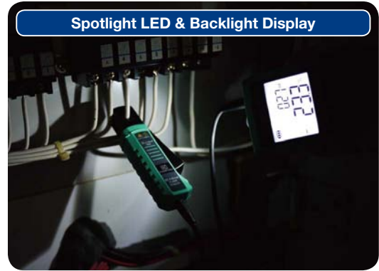
Spotlight LED & Backlight Display