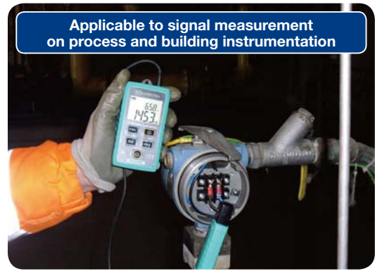
Applicable to signal measurement on process and building instrumentation